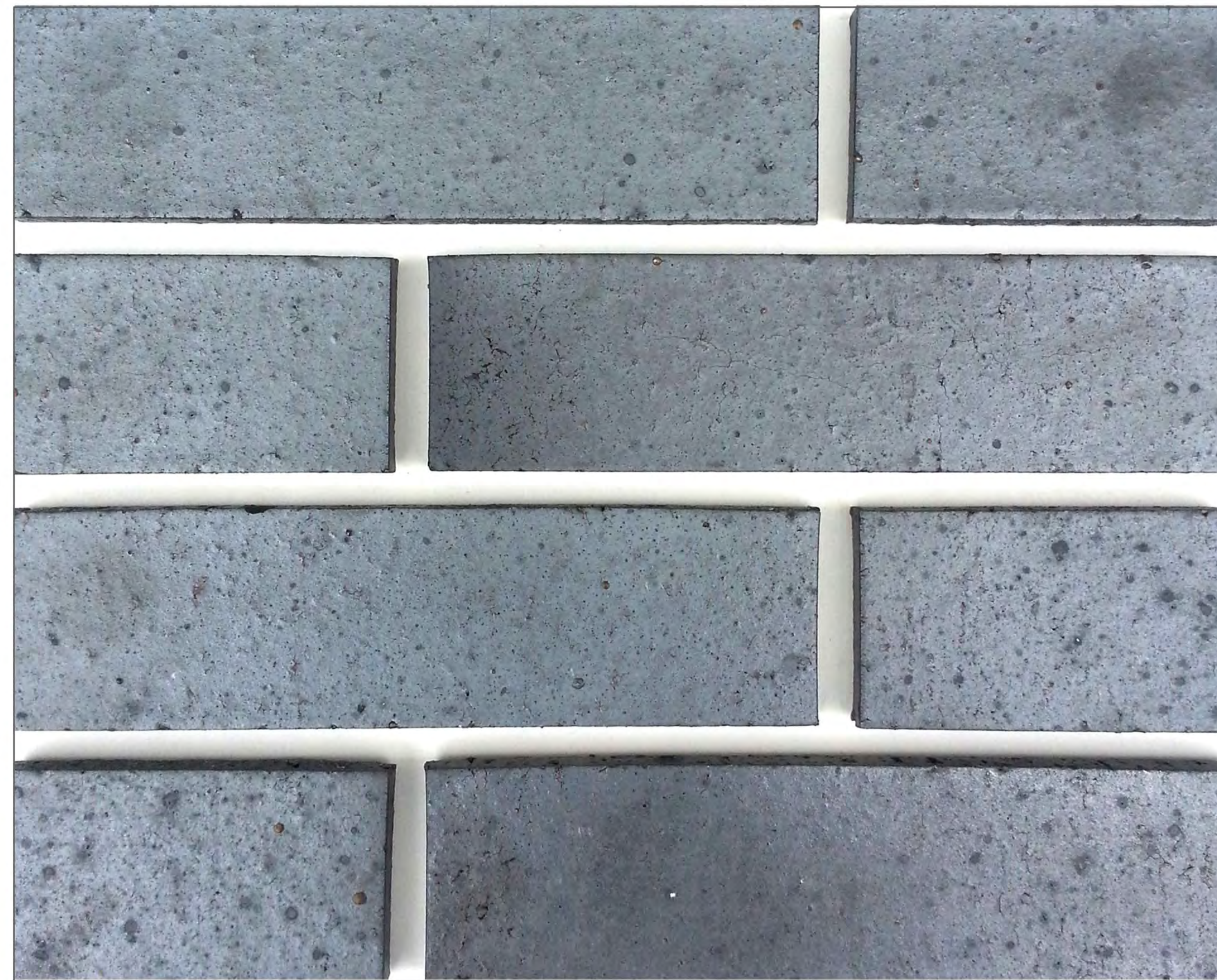
E) BRICK VENEER 2 CHARCOAL (S85) - ENGOBE SERIES