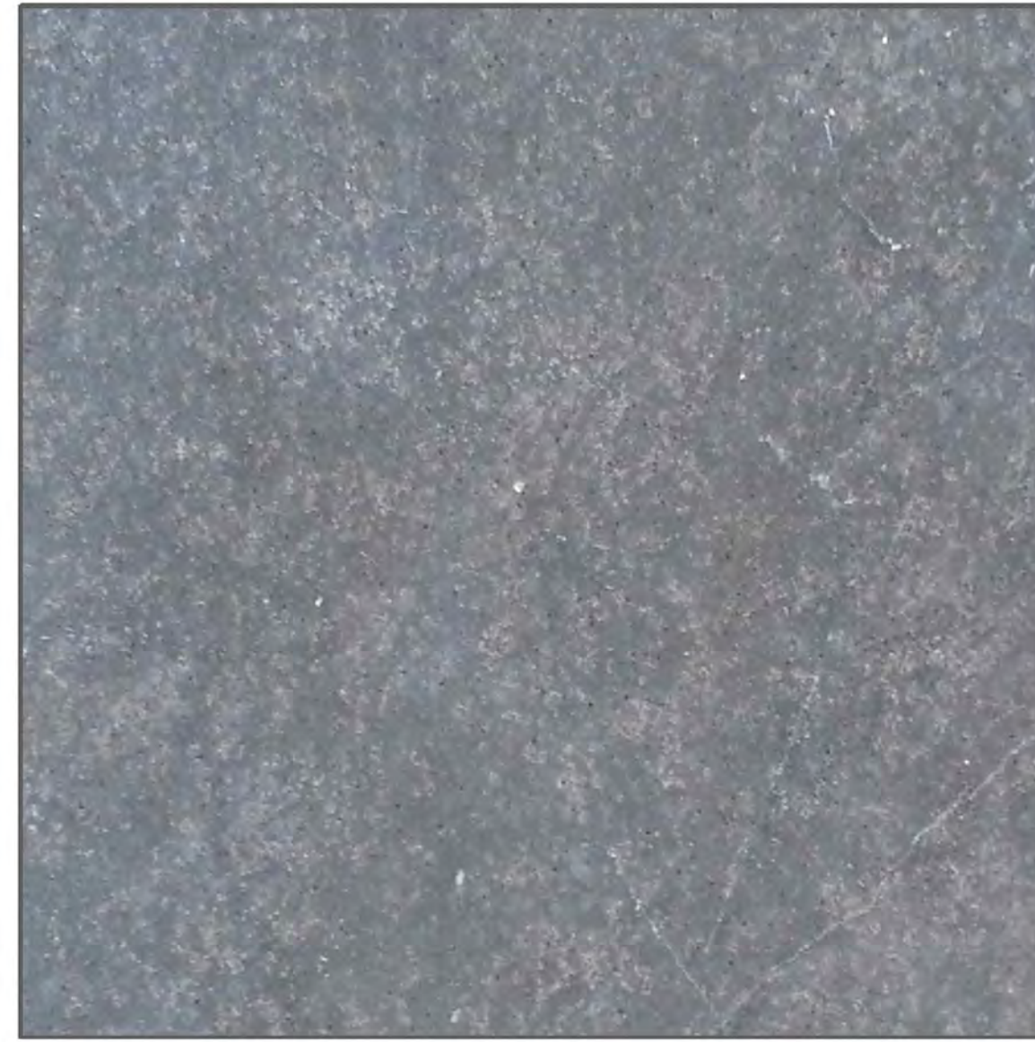
G) STONE VENEER 1: TOWER BLACK - ANTIQUE RUGO STONE